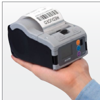
Small & Light Durable & Dependable

Quick and Durable. Ultimate Performance and Mobility.