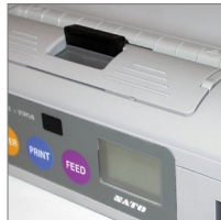
Top Cover Opening for Easy Media Load