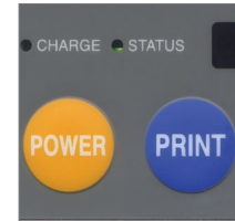
Large Operator Control Buttons