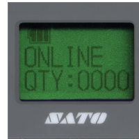
Large LCD Display (802.11 b/g model)